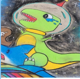
JUNE 2 CHALK, WALK & BOOGIE