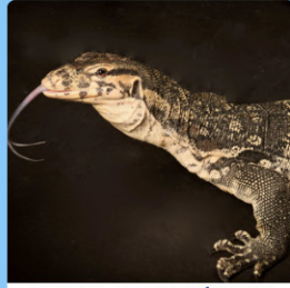
JUNE 16 SCALES & TAILS FARMERS MARKET OPENING