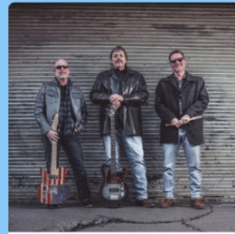
JUNE 23 YOUTH THEATRE & SONIC DUKE