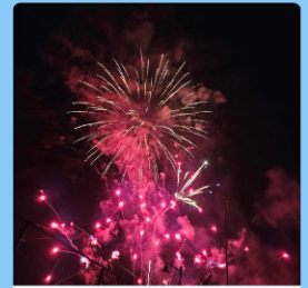
JUNE 30 SALUTE TO AMERICA