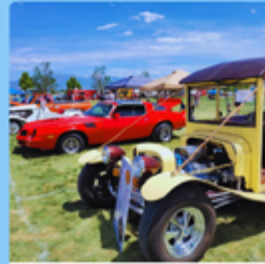
JULY 21- BECK BROTHERS BAND & POP-UP CAR SHOW