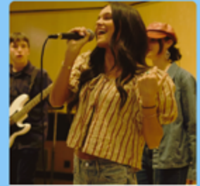
JULY 28- BLUE NOTE BIG BAND & STREETLIGHT SYNDICATE