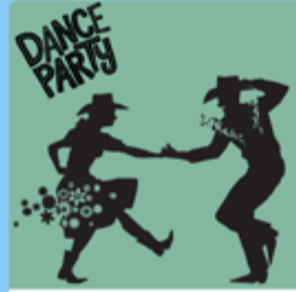
JULY 14- LINE DANCING WITH SWINGIN' DANCE CO.