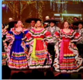
JULY 7- DANZA Y COLOR UTAH