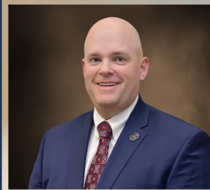
Jim Miller City Council 2010–2014 Mayor 2014–2026