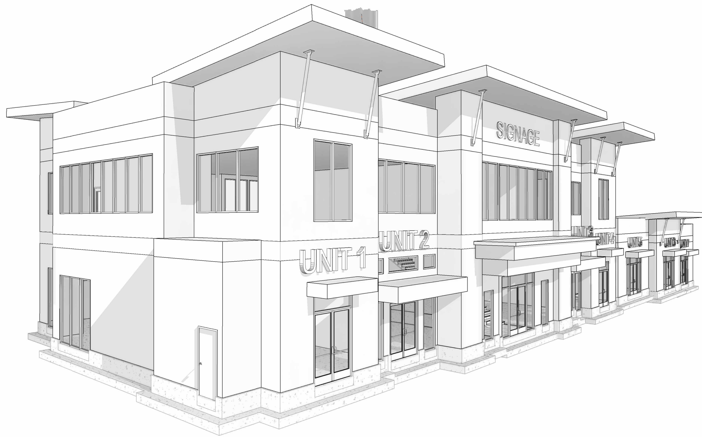
3 NORTH - WEST ELEVATION SCALE:

The drawings, designs, ideas, arrangements and plans indicated or represented are the sole property of Clinton Layton and Associates and are subject to the copyright of Clinton Layton and Associates or its assigns. They were created, prepared and developed for use on, and in conjunction with the specified project. Any use of this drawing, design, materials or information contained herein, including but not limited to copying or reproduction, which is not expressly authorized by Layton Davis Architects, is strictly prohibited as an infringement of its copyright and may result in liability.