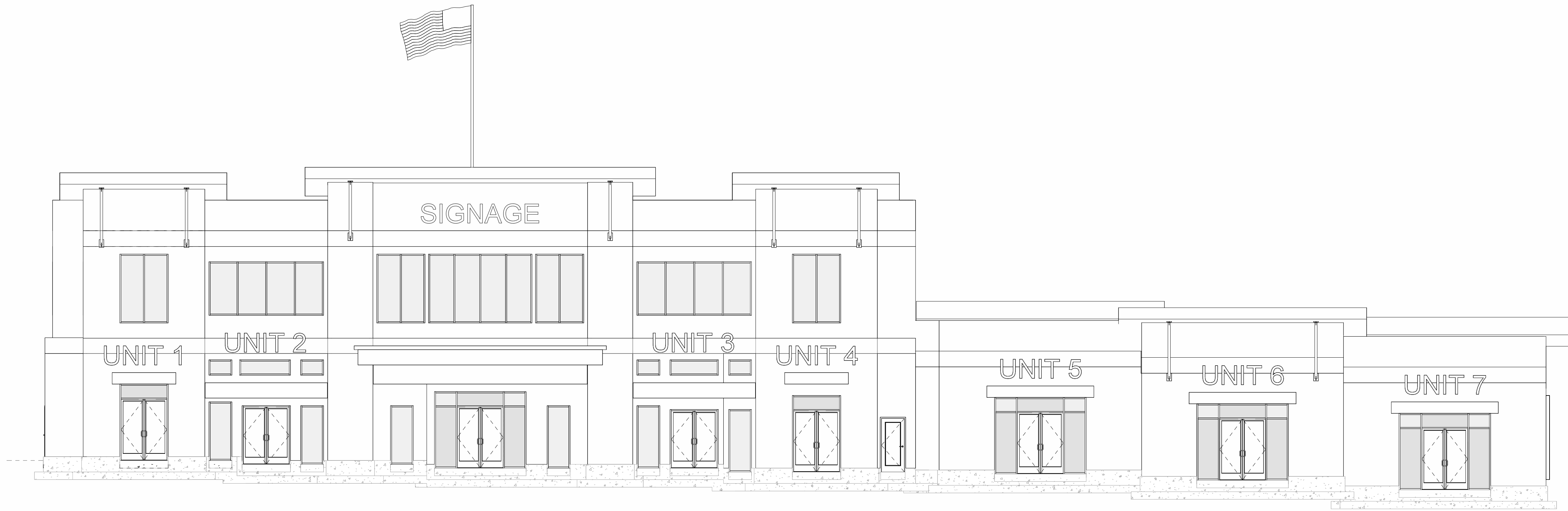
1 WEST ELEVATION SCALE: 1/8" = 1'-0"