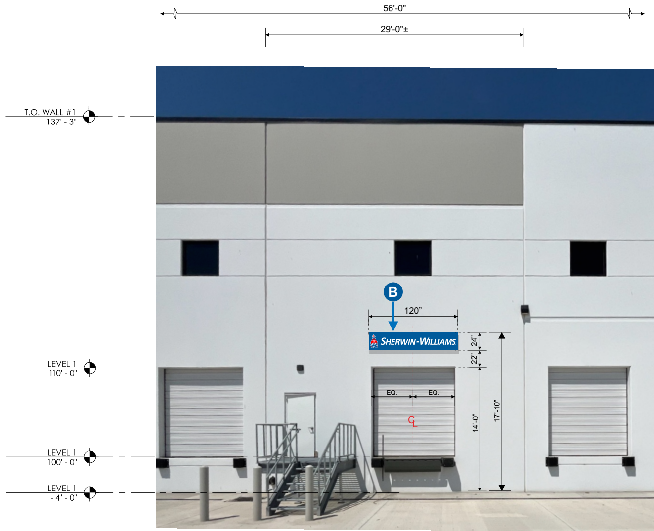
EAST ELEVATION - REAR