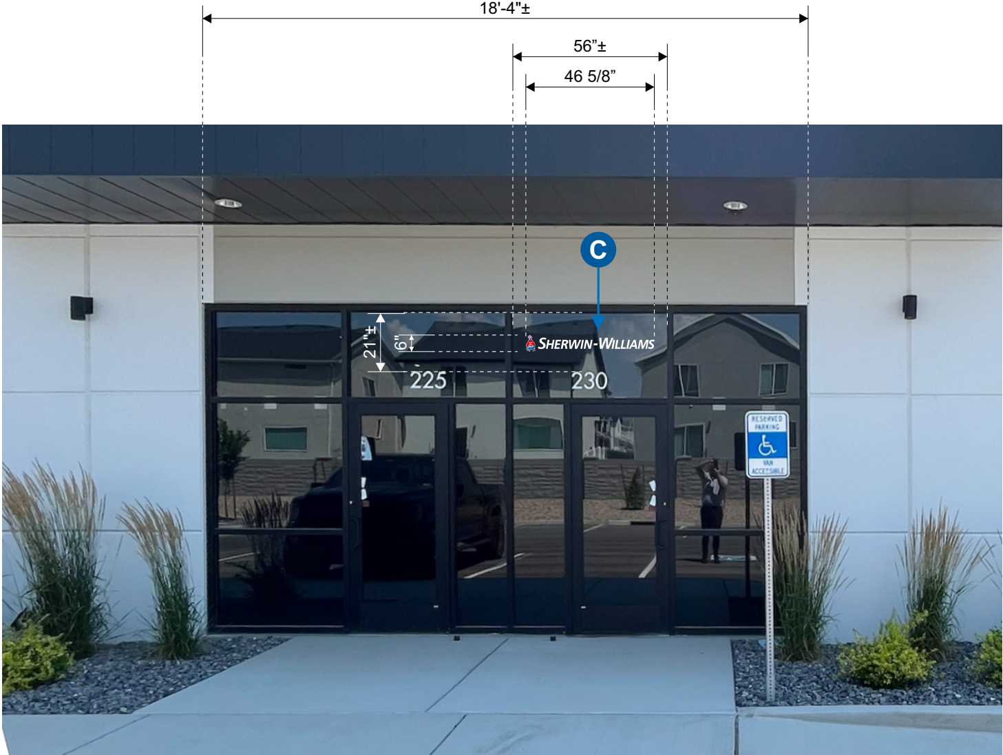
WEST ENTRY ELEVATION