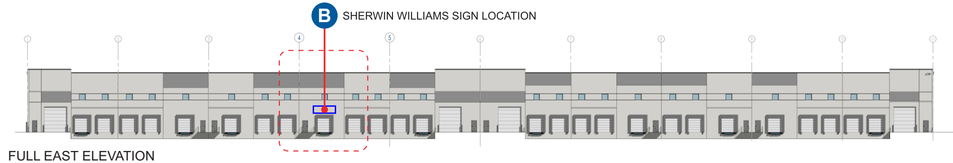
FULL EAST ELEVATION